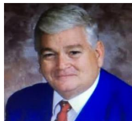
"A Good Name"

I marched in the Heritage Festival/October Fest parade. In Hohenwald, the predominant historical families are Swiss and German, and those were represented well. The County Librarian lead the way in her beautifully embroidered Swiss style outfit. The Little Bell Ringer who would declare the festival open was a direct descendant of one of the founding German settlers and dressed in her German culture costume. There was Lewis' expedition guide. In the opening ceremony, it was noted that Lewis County had four primary root stock ancestries, German and Swiss colonizers, the Appalachian folks who welcomed them, and the Native folks who did not much welcome any of the others.