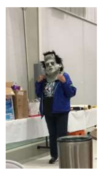
Mystery UMW Lady